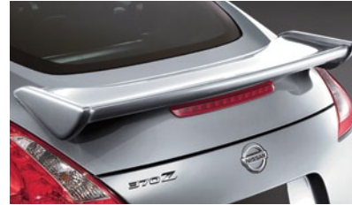
NISMO Rear Decklid Spoiler (Coupe Only) 1