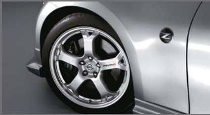
NISMO 19" Forged Alloy Wheels 1

Nissan 370Z® Coupe and Roadster shown with NISMO Aerodynamic Kit, NISMO Graphics (Coupe), 19" Polished Forged Alloy Wheels (Roadster) and NISMO 19" Forged Alloy Wheels (Coupe).