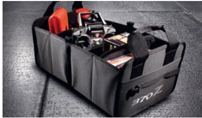
Trunk Cargo Organizer