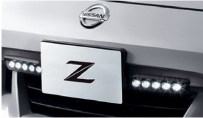
LED Daytime Running Lights