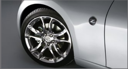
19" Polished Forged Wheels