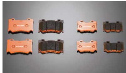
NISMO Brake Pads 3