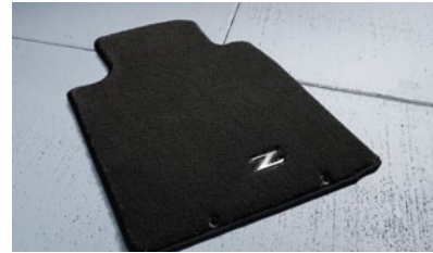
Premium Carpeted Floor Mats with Metal Z ® Logo