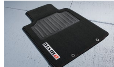
NISMO Carpeted Floor Mats 1