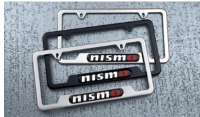
NISMO License Plate Frames 1