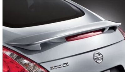
Rear Decklid Spoiler (Coupe Only)