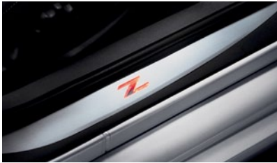
Illuminated Kick Plates (2-piece)