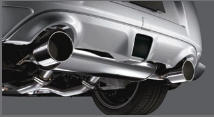
NISMO Cat-back Exhaust 1