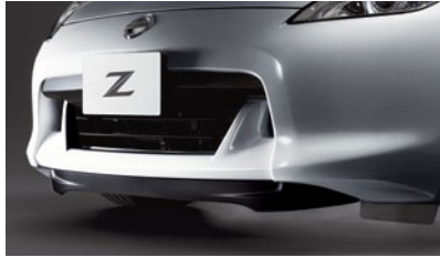
Front Chin Aero Deflector