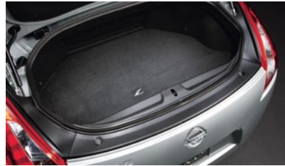
Carpeted Trunk Mat